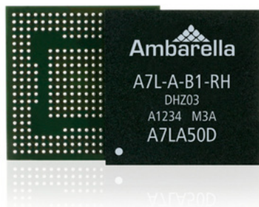
The A7L-A SoC is ideal for next generation automotive camera designs.

A7L-A enables WiFi connectivity for reviewing the captured video clips on iOS and Android devices. The SDK leverages Ambarella's multi-stream encoding capability which supports the recording of full HD video while simultaneously recording and streaming a second stream to the smartphone.